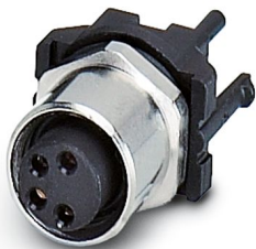
Device connector rear mounting, 4-position, Socket, straight, M8, A-coding, Wave soldering

Please be informed that the data shown in this PDF document is generated from our online catalog. Please find the complete data in the user documentation. Our general terms of use for downloads are valid.