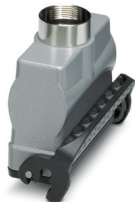
HEAVYCON B24 coupling housing, with single locking latch, height: 80.5 mm, with 1 x M32 gland, straight cable outlet

Please be informed that the data shown in this PDF document is generated from our online catalog. Please find the complete data in the user documentation. Our general terms of use for downloads are valid.