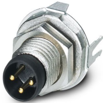
Device connector rear mounting, Universal, 3-position, Pin, straight, M8, A-coding, Wave soldering

Please be informed that the data shown in this PDF document is generated from our online catalog. Please find the complete data in the user documentation. Our general terms of use for downloads are valid.