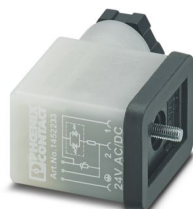
Valve connector, Universal, 3-position, Valve connector BI (11 mm), Screw connection, cable gland M16, external cable diameter 6 mm ... 8 mm

Please be informed that the data shown in this PDF document is generated from our online catalog. Please find the complete data in the user documentation. Our general terms of use for downloads are valid.