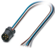
The figure shows the 5-position version of the product

Please be informed that the data shown in this PDF document is generated from our online catalog. Please find the complete data in the user documentation. Our general terms of use for downloads are valid.