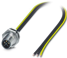
The figure shows the standard item

Please be informed that the data shown in this PDF document is generated from our online catalog. Please find the complete data in the user documentation. Our general terms of use for downloads are valid.