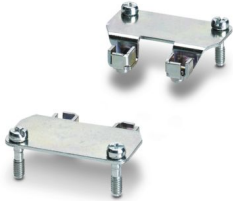
Adapter insert, design: D25

Please be informed that the data shown in this PDF document is generated from our online catalog. Please find the complete data in the user documentation. Our general terms of use for downloads are valid.