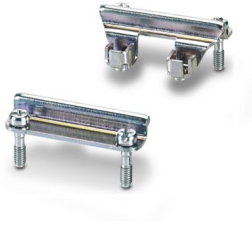
Adapter insert, design: D15

Please be informed that the data shown in this PDF document is generated from our online catalog. Please find the complete data in the user documentation. Our general terms of use for downloads are valid.