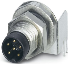
Device connector rear mounting, 6-position, Pin, angled, M8, A-coding, Wave soldering

Please be informed that the data shown in this PDF document is generated from our online catalog. Please find the complete data in the user documentation. Our general terms of use for downloads are valid.