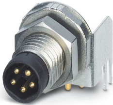
Device connector rear mounting, 5-position, Pin, angled, M8, B-coding, Wave soldering

Please be informed that the data shown in this PDF document is generated from our online catalog. Please find the complete data in the user documentation. Our general terms of use for downloads are valid.