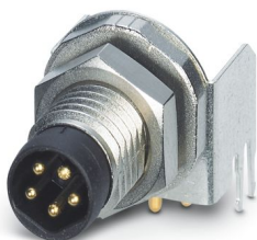
Device connector rear mounting, 5-position, Pin, angled, M8, B-coding, Wave soldering

Please be informed that the data shown in this PDF document is generated from our online catalog. Please find the complete data in the user documentation. Our general terms of use for downloads are valid.