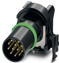
The figure shows the shielded version

Please be informed that the data shown in this PDF document is generated from our online catalog. Please find the complete data in the user documentation. Our general terms of use for downloads are valid.