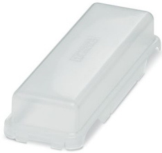
Protective cover, design: B24

Please be informed that the data shown in this PDF document is generated from our online catalog. Please find the complete data in the user documentation. Our general terms of use for downloads are valid.