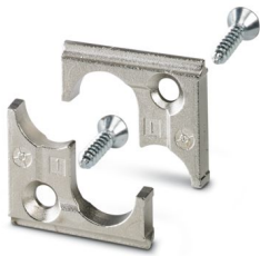
Adapter, application: Shield adapters

Please be informed that the data shown in this PDF document is generated from our online catalog. Please find the complete data in the user documentation. Our general terms of use for downloads are valid.