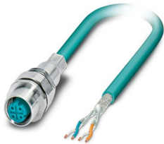
Bus system flush-type socket

Please be informed that the data shown in this PDF document is generated from our online catalog. Please find the complete data in the user documentation. Our general terms of use for downloads are valid.