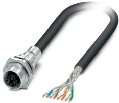
Flush-type connector, 4-position, Bus line

Please be informed that the data shown in this PDF document is generated from our online catalog. Please find the complete data in the user documentation. Our general terms of use for downloads are valid.