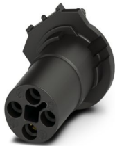
The figure shows the unshielded version

Please be informed that the data shown in this PDF document is generated from our online catalog. Please find the complete data in the user documentation. Our general terms of use for downloads are valid.