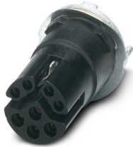
M12 female contact carrier, straight

Please be informed that the data shown in this PDF document is generated from our online catalog. Please find the complete data in the user documentation. Our general terms of use for downloads are valid.