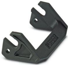
Single locking latch for B10 housing, HC-EVO....AL and HC-STA....AL

Please be informed that the data shown in this PDF document is generated from our online catalog. Please find the complete data in the user documentation. Our general terms of use for downloads are valid.