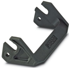
Single locking latch for B16 housing, HC-EVO....AL and HC-STA....AL

Please be informed that the data shown in this PDF document is generated from our online catalog. Please find the complete data in the user documentation. Our general terms of use for downloads are valid.