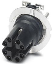
M12 female contact carrier, straight

Please be informed that the data shown in this PDF document is generated from our online catalog. Please find the complete data in the user documentation. Our general terms of use for downloads are valid.