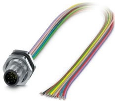
The figure shows the 12-pos. product version

Please be informed that the data shown in this PDF document is generated from our online catalog. Please find the complete data in the user documentation. Our general terms of use for downloads are valid.