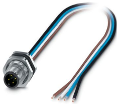
The figure shows the 4-pos. version

Please be informed that the data shown in this PDF document is generated from our online catalog. Please find the complete data in the user documentation. Our general terms of use for downloads are valid.