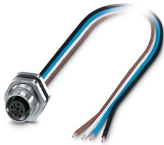
The figure shows the 4-pos., A-coded version

Please be informed that the data shown in this PDF document is generated from our online catalog. Please find the complete data in the user documentation. Our general terms of use for downloads are valid.