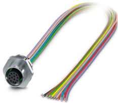
The figure shows the 12-pos. product version

Please be informed that the data shown in this PDF document is generated from our online catalog. Please find the complete data in the user documentation. Our general terms of use for downloads are valid.