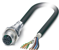
M12 panel feed-through, rear mounting

Please be informed that the data shown in this PDF document is generated from our online catalog. Please find the complete data in the user documentation. Our general terms of use for downloads are valid.