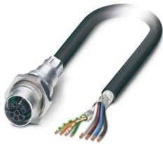
M12 panel feed-through, rear mounting

Please be informed that the data shown in this PDF document is generated from our online catalog. Please find the complete data in the user documentation. Our general terms of use for downloads are valid.