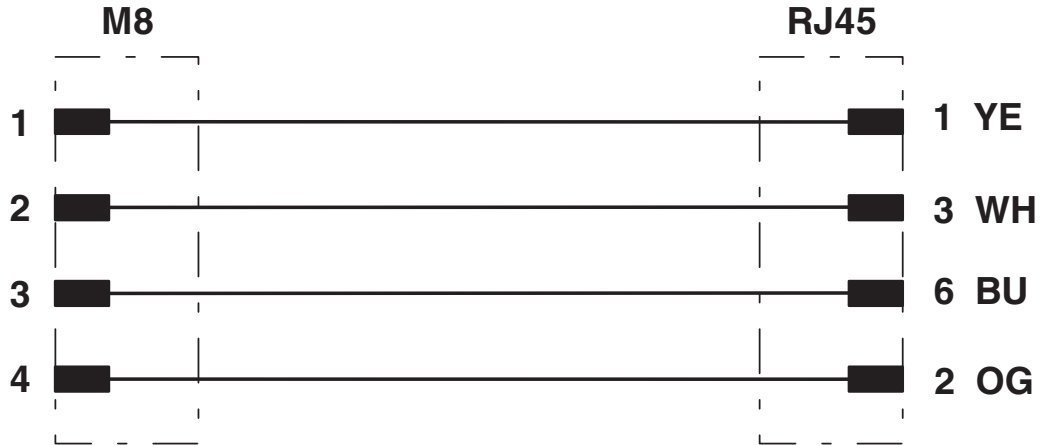
Contact assignment of the M8 and RJ45 plug