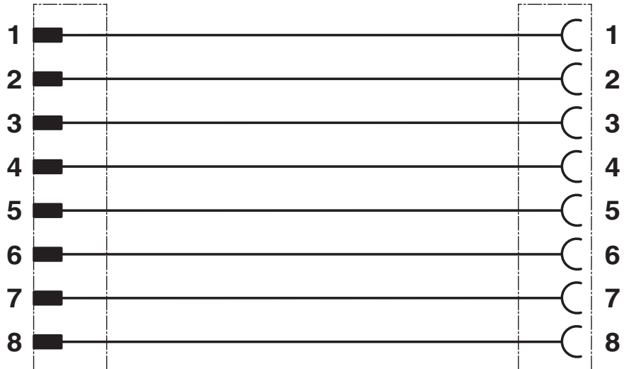
Contact assignment of the M12 plug and the M12 socket