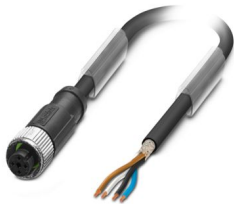
with VA knurl

Please be informed that the data shown in this PDF document is generated from our online catalog. Please find the complete data in the user documentation. Our general terms of use for downloads are valid.