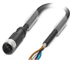
with VA knurl

Please be informed that the data shown in this PDF document is generated from our online catalog. Please find the complete data in the user documentation. Our general terms of use for downloads are valid.