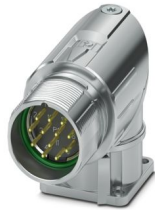
The figure shows the 12-position version

Please be informed that the data shown in this PDF document is generated from our online catalog. Please find the complete data in the user documentation. Our general terms of use for downloads are valid.