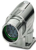
The figure shows the 12-position version

Please be informed that the data shown in this PDF document is generated from our online catalog. Please find the complete data in the user documentation. Our general terms of use for downloads are valid.