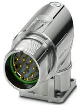
The figure shows the 12-position version

Please be informed that the data shown in this PDF document is generated from our online catalog. Please find the complete data in the user documentation. Our general terms of use for downloads are valid.