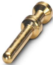
Crimp contact, series: HC-M-06, Pin, turned

Please be informed that the data shown in this PDF document is generated from our online catalog. Please find the complete data in the user documentation. Our general terms of use for downloads are valid.