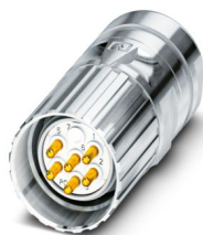
The figure shows the product version with solder contacts

Please be informed that the data shown in this PDF document is generated from our online catalog. Please find the complete data in the user documentation. Our general terms of use for downloads are valid.