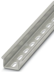
DIN rail, similar to EN 60715, material: Steel, zinc plating, color: silver

Please be informed that the data shown in this PDF document is generated from our online catalog. Please find the complete data in the user documentation. Our general terms of use for downloads are valid.