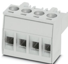
The figure shows the standard item without printing

PCB connector, nominal cross section: 2.5 mm 2 , color: light gray, nominal current: 16 A (see derating curve), rated voltage (III/2): 320 V, contact surface: Sn, contact connection type: Socket, number of potentials: 4, number of rows: 1, number of positions: 4, number of connections: 4, product range: MSTBT 2,5 HC/..-STP, pitch: 5 mm, connection method: Screw connection with tension sleeve, conductor/PCB connection direction: 0 °, locking clip: - Locking clip, plug-in system: COMBICON MSTB 2,5 advanced, locking: without, mounting method: without, type of packaging: packed in cardboard, Printed version