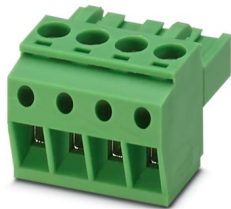
The figure shows a 4-pos. version of the product

PCB connector, nominal cross section: 2.5 mm 2 , color: light gray, nominal current: 12 A, rated voltage (III/2): 320 V, contact surface: Sn, contact connection type: Socket, number of rows: 1, number of positions: 4, product range: MSTBTP 2,5/..-ST, pitch: 5 mm, connection method: Screw connection with tension sleeve, screw head form: L Slotted, conductor/PCB connection direction: 0 °, locking clip: - Locking clip, plug-in system: COMBICON MSTB 2,5, locking: without, mounting method: without, type of packaging: packed in cardboard