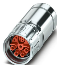
Figure shows standard item with data element

Please be informed that the data shown in this PDF document is generated from our online catalog. Please find the complete data in the user documentation. Our general terms of use for downloads are valid.