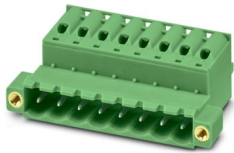
The figure shows an 8-pos. version of the product

PCB connector, nominal cross section: 2.5 mm 2 , color: green, nominal current: 12 A, rated voltage (III/2): 320 V, contact surface: Sn, contact connection type: Pin, number of potentials: 8, number of rows: 1, number of positions: 8, number of connections: 8, product range: FKIC 2,5/..-STGF, pitch: 5.08 mm, connection method: Push-in spring connection, conductor/PCB connection direction: 0 °, locking clip: - without locking clip, plug-in system: COMBICON MSTB 2,5, locking: Screw locking mechanism for cable-to-cable connection, mounting method: Threaded flange, type of packaging: packed in cardboard