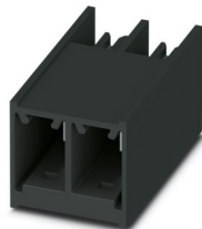
The figure shows a 2-position version

PCB headers, nominal cross section: 6 mm 2 , color: black, nominal current: 41 A, rated voltage (III/2): 630 V, contact surface: Sn, contact connection type: Pin, number of rows: 1, number of positions: 4, product range: PC 6/..-G, pitch: 7.62 mm, mounting: Wave soldering, pin layout: Linear pinning, solder pin [P]: 2.6 mm, number of solder pins per potential: 3, plug-in system: COMBICON PC 6, Pin connector pattern alignment: Standard, locking: without, mounting method: without, type of packaging: packed in cardboard