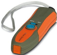
Red light source (650 nm)

https://www.phoenixcontact.com/us/products/1414098