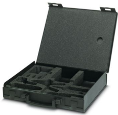
Replacement case, empty

https://www.phoenixcontact.com/us/products/1414095