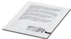
Fiber cleaning cloth

https://www.phoenixcontact.com/us/products/1414104