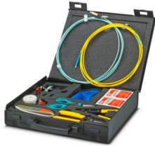
Tool set for GOF assembly

Please be informed that the data shown in this PDF document is generated from our online catalog. Please find the complete data in the user documentation. Our general terms of use for downloads are valid.