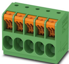
The figure shows a 5-pos. version of the product in green

PCB terminal block, nominal current: 41 A, rated voltage (III/2): 1000 V, nominal cross section: 4 mm 2 , number of potentials: 4, number of rows: 1, number of positions per row: 4, product range: TDPT 4/...-SP, pitch: 6.35 mm, connection method: Push-in spring connection, mounting: Wave soldering, conductor/PCB connection direction: 0 °, color: gray, Pin layout: Zigzag pinning W, Solder pin [P]: 3.5 mm, number of solder pins per potential: 1, type of packaging: packed in cardboard