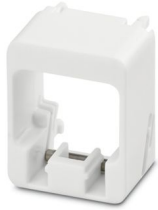
Plug Guard Security Frame

Please be informed that the data shown in this PDF document is generated from our online catalog. Please find the complete data in the user documentation. Our general terms of use for downloads are valid.