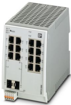
The figure shows a version of the product

Please be informed that the data shown in this PDF document is generated from our online catalog. Please find the complete data in the user documentation. Our general terms of use for downloads are valid.