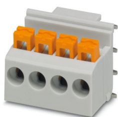
The figure shows a version of the article

Printed circuit board terminal, nominal current: 22 A, rated voltage (III/2): 250 V, nominal cross section: 2.5 mm 2 , number of potentials: 4, number of rows: 1, number of positions per row: 4, product range: FKDSO 2,5/...-R, pitch: 5 mm, connection method: Push-in spring connection, mounting: Wave soldering, conductor/PCB connection direction: 0 °, color: light gray, Pin layout: Linear pinning, Solder pin [P]: 3.5 mm, number of solder pins per potential: 1, type of packaging: packed in cardboard. Printed version, item with pin output on the right