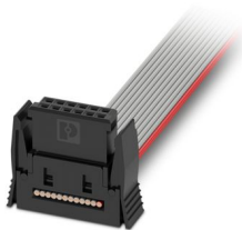
The figure shows a 12-pos. version with 12 contacts

Assembled IDC female connector, rated current: 1.2 A, cable length: Free input (0.05 ... 0.95 m), Cable type: Flat cable, For preassembled samples, see the "Accessories" tab., product range: FR 1,27/...-Cabling