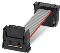
The figure shows a 12-pos. version with 12 contacts

Assembled IDC female connector, rated current: 1.2 A, cable length: Free input (0.05 ... 0.95 m), Cable type: Flat cable, For preassembled samples, see the "Accessories" tab., product range: FR 1,27/...-Cabling