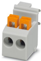
The figure shows the light gray version

PCB terminal block, nominal current: 22 A, rated voltage (III/2): 250 V, nominal cross section: 2.5 mm 2 , number of potentials: 2, number of rows: 1, number of positions per row: 2, product range: FKDSO 2,5/..-R, pitch: 5 mm, connection method: Push-in spring connection, mounting: Wave soldering, conductor/PCB connection direction: 0 °, color: gray, Pin layout: Linear pinning, Solder pin [P]: 3.5 mm, number of solder pins per potential: 1, type of packaging: packed in cardboard. Product with pin output on right side