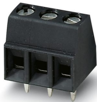
The figure shows standard version

Printed circuit board terminal, nominal current: 13.5 A, rated voltage (III/2): 200 V, nominal cross section: 1.5 mm 2 , number of potentials: 6, number of rows: 1, number of positions per row: 6, product range: MKDS 1/..-HT, pitch: 3.81 mm, connection method: Screw connection with tension sleeve, screw head form: L Slotted, mounting: THR soldering / wave soldering, conductor/PCB connection direction: 0 °, color: black, Pin layout: Linear pinning, Solder pin [P]: 1.65 mm, number of solder pins per potential: 1, type of packaging: packed in cardboard