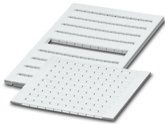
The figure shows the white version

Please be informed that the data shown in this PDF document is generated from our online catalog. Please find the complete data in the user documentation. Our general terms of use for downloads are valid.